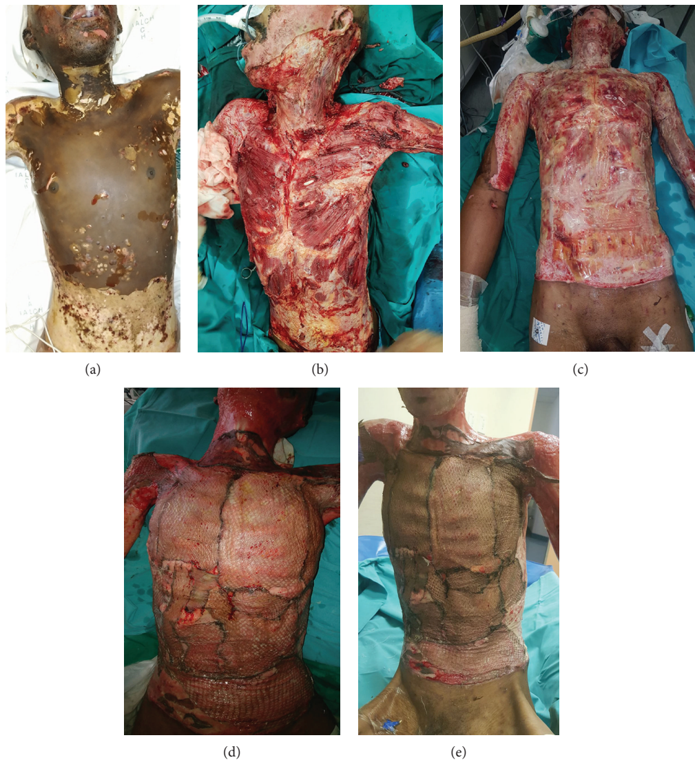
FIGURE 2: Representative images for patient 1. (a) Admission picture where a full-thickness burn over the anterior torso and neck is evidenced. (b) Post excision of burn eschar. (c) After application of Integra. (d) After application of PRF/spray-on skin; first dressing change: near-complete reepithelialization of grafted areas. (e) Results after 10 days postgrafting.

microbiocidal proteins and have been shown to engulf viruses and bacteria. The many growth factors produced by the platelet encourage multiplication as well as vascular ingrowth to provide nutrition to the seeded cells. Cell adhesion molecules released by platelets, such as fibronectin and vitronectin, enhance the migration of epithelial and vascular cells [26]. It has also been suggested that the fibrin strands may act as a template for epidermal migration [7]. Agren et al. [14] demonstrated that PRF, as obtained using the Vivostat technology, contains 3.9 times as many platelets as the baseline blood, as well increased levels of transforming growth factor- \beta 1, platelet-derived growth factor-AB, basic fibroblast growth factor, and vascular endothelial growth factor. MMP-9 levels were reduced 139-fold. The beneficial effects of PRP on wound healing have been confirmed in vitro by Xian et al. [27] and in a murine study by Law et al. [28]. The effects of PRP seem to be concentration-dependent, with higher concentrations promoting inflamma-