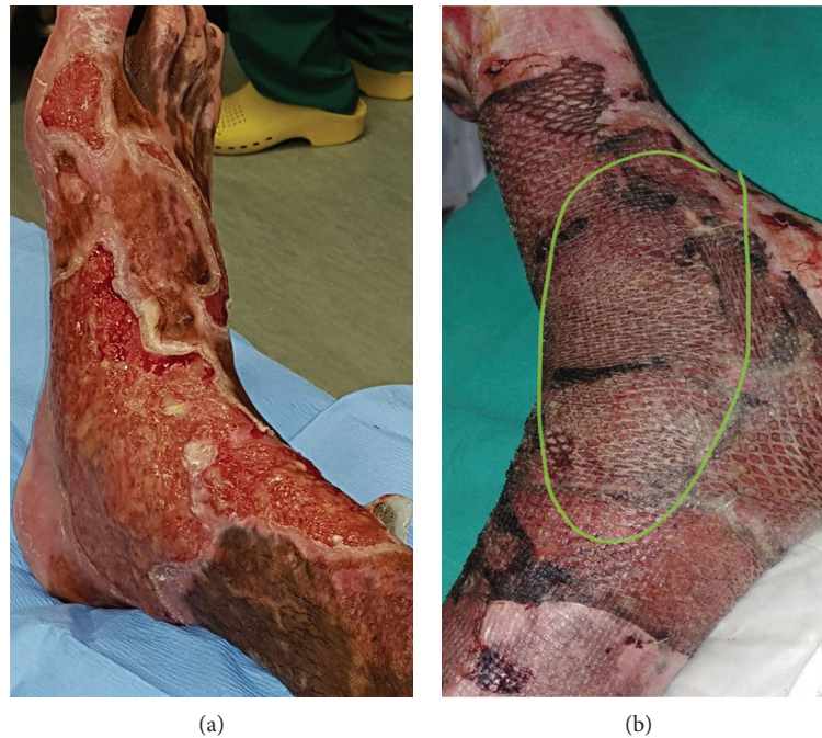
FIGURE 3: Representative images for patient 3. (a) Chronic burn wound with failed graft, overgranulation, and inflammatory margins. (b) Day 4 post widely meshed graft and PRF/spray-on skin where the wound is already reepithelialized.